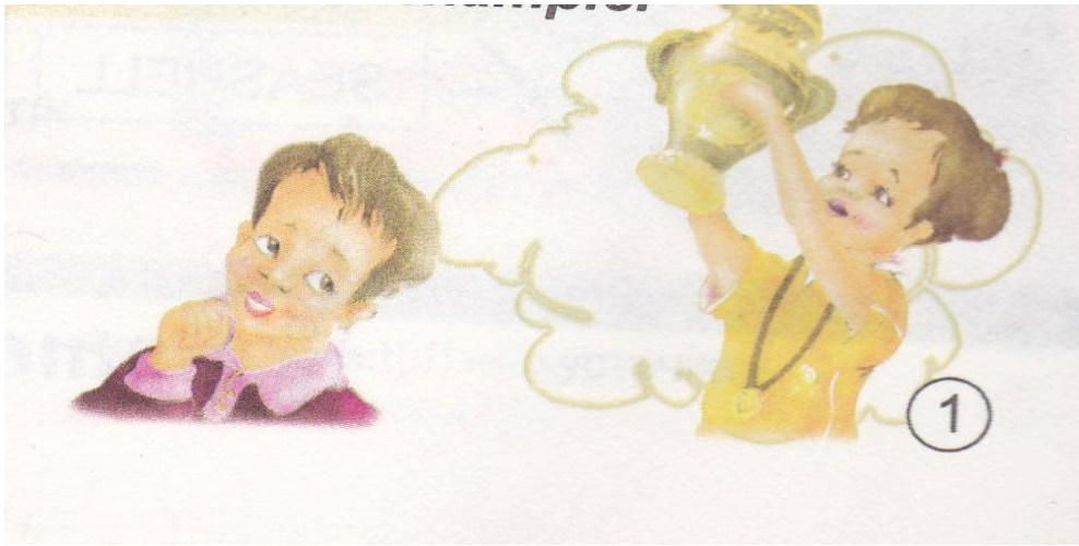
He is dreaming about winning a prize.