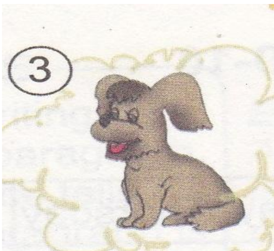
He is dreaming about having a pet.