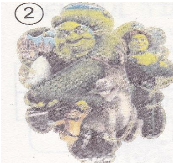
He is dreaming about watching “Shrak”